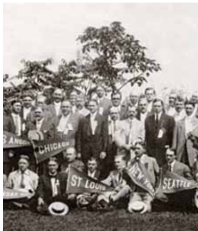
Rotary's first fiscal year began the day after the first convention ended. The convention of the Rotary Clubs of America was held in Rotary's birthplace, Chicago, in 1910.

Rotary's first fiscal year began the day after the first convention ended, on 18 August 1910. The 1911-12 fiscal year also related to the convention, beginning with the first day of the 1911 convention on 21 August.