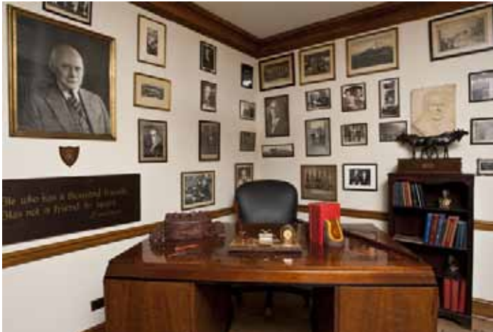
The Paul Harris Room at One Rotary Center in Evanston, Illinois, USA. March 2010.

On 19 April, Rotarians celebrate the birthday of Rotary's founder, Paul P. Harris.